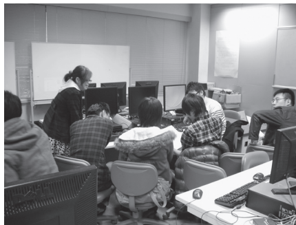
Picture 1 Discussion Scene on the case lead discussion (14 Dec. 2010)

The problem is that there is a shortage of members of the local fire brigade. Most of them are over 60 years old. The members who join the festival under the hot sun and support it, are the ones who can leave their shops safely in the hands of other people. She pondered whether she can join the festival as a fire brigade member next year and how long she can keep going.