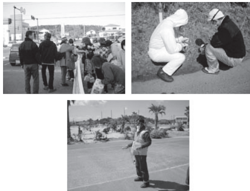
Picture 4 Some activities by the local fire brigade and volunteer members (After the Eastern Japan Great Earthquake and Tsunami and Fukushima incident) 1

If we face a case like our research which may happen in real society on a daily basis but to which there is no particular answer, a method like Etude, which gives us the opportunity to tackle and find a solution, will be more significant. I wouldn't be more delighted if this research gave rise to arguments for how we should improve the way of learning in the future.